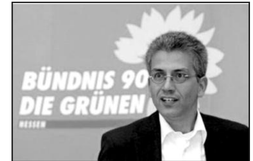
Tarek Al-Wazir, Hessian Greens co-chair

January/Europe: On January 18th, the Greens in the German state of Hesse received 13.7% of the vote, the highest percentage ever for